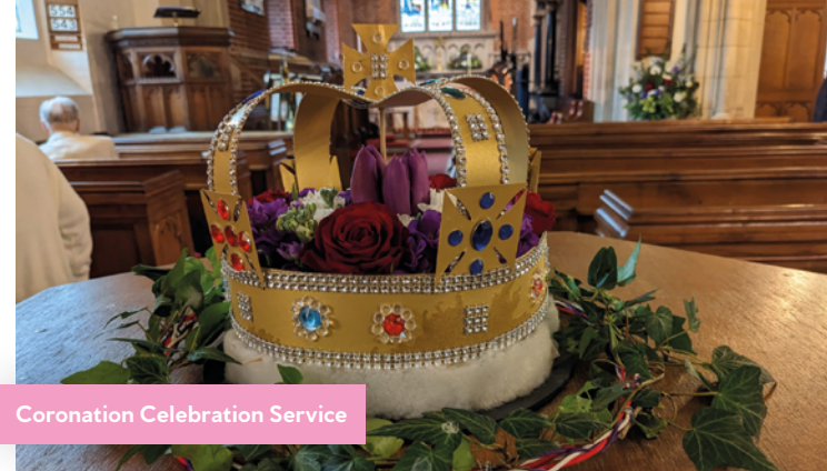
Coronation Celebration Service