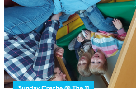
Sunday Creche @ The 11