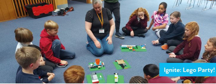
Ignite: Lego Party!