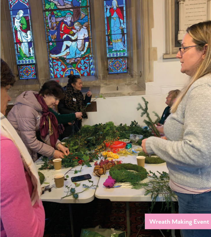
Wreath Making Event