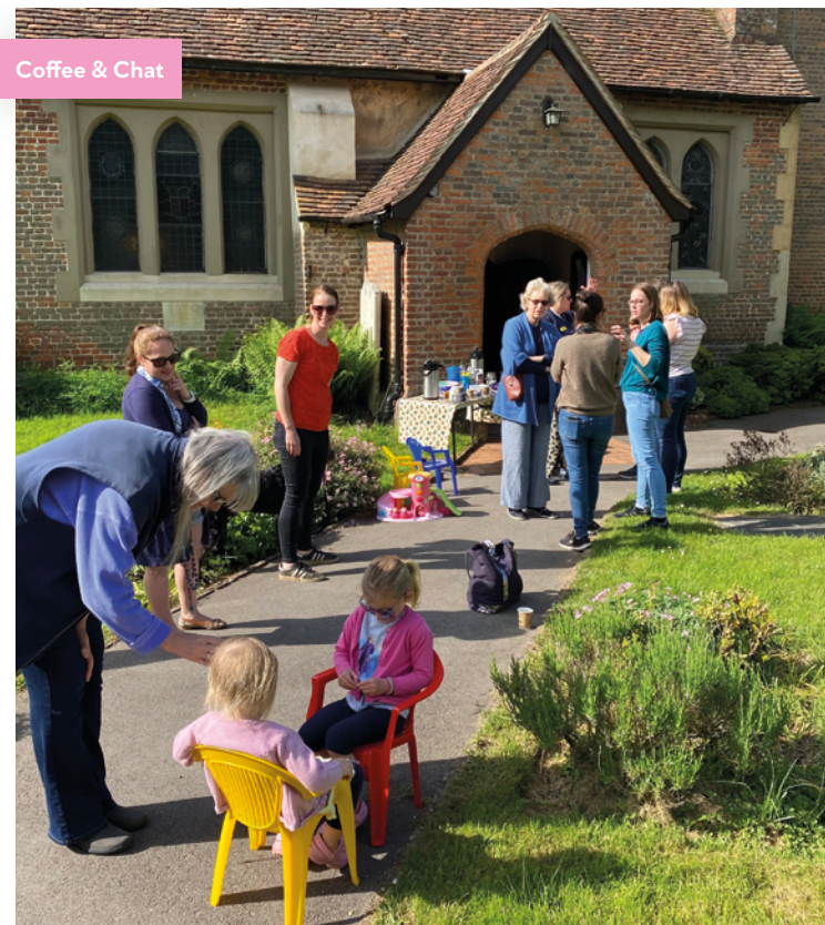
Coffee & Chat