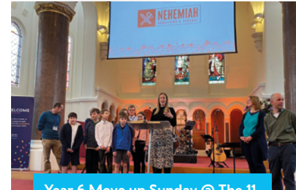
Year 6 Move up Sunday @ The 11