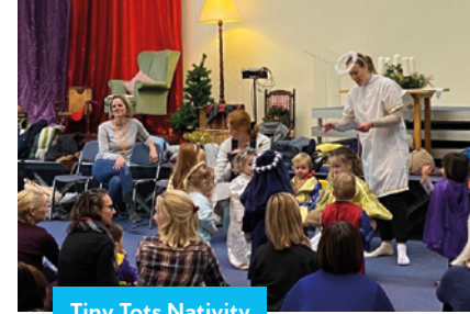
Tiny Tots Nativity