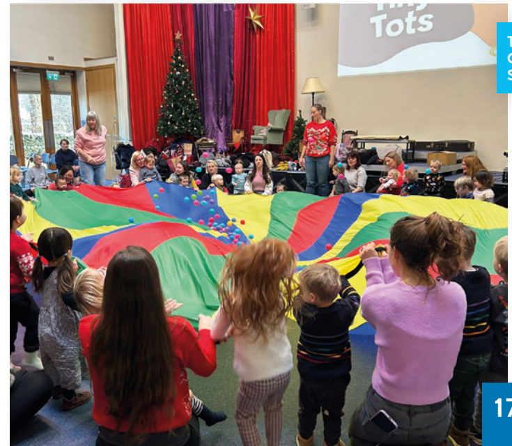
Tiny Tots Christmas Special